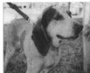
BO , an adult male 'coon hound, sweet and sensitive.