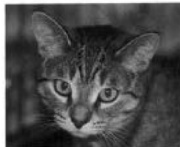
PAM , a young adult female, sweet and sincere.