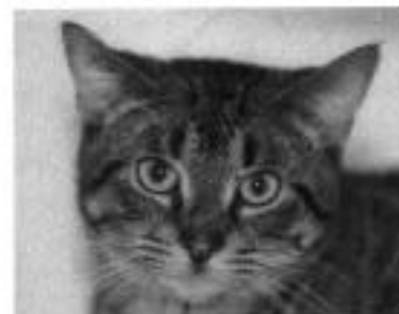
ZEKE , a young, adult male, lively and lovable.