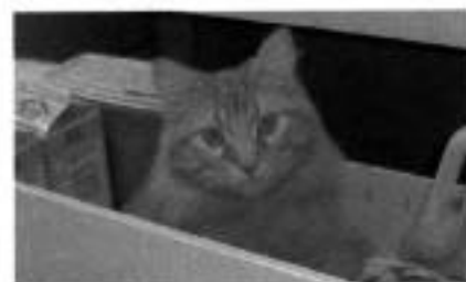
MANGO , an adult male, very lovable and inquisitive.