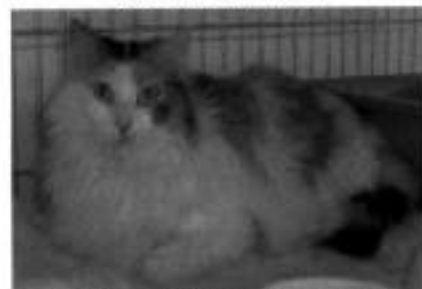
PATCHES , an adult female, serene and affectionate.